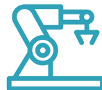
Machinery & equipment