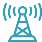
Telecom equipment & apparatus