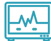
Medical & precision instruments