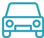
Vehicles, & trailers